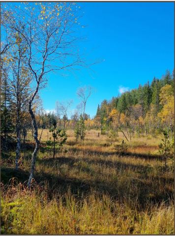
Timber road crossing the mire south of Ritalamp.

Going north, the terrain is fairly flat with coniferous forest. After passing the farm Nordtomten (please keep away from the electrical fencing and respect the signs) you cross a mire area before reaching the Sunne border. A few hundred meters into the Sunne-side the Finnleden ends and you continue on Ängenleden.