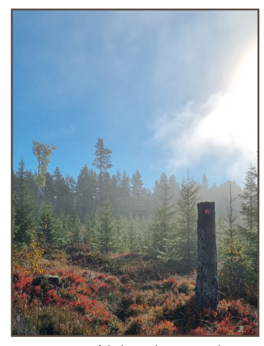
Area with heather, south of Karlbergslyckan.