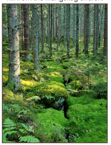
Spruce forest and moss on the heights north of the church.