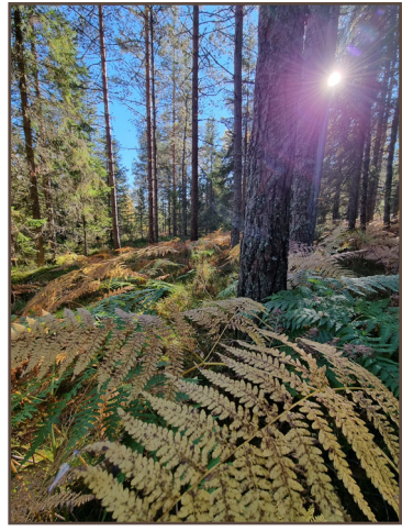
Pine forest on mountaneous ground north of Patrontorp.