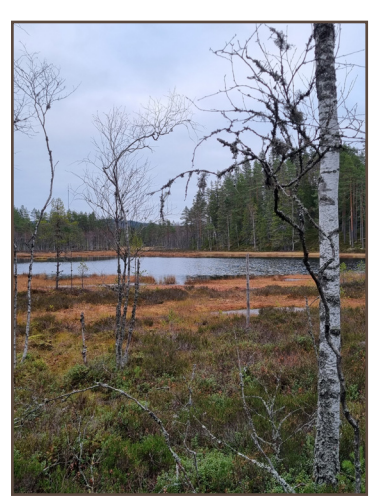
Långtjärnet in Bjurbäcken.