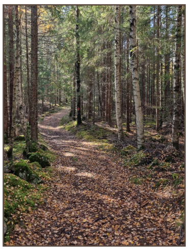
Carriage road climbing up the hill from the Mangskog church.

The trail takes off northwest onto a logging road. Passing the creek at the junction, you enter the Bjurbäcken area. Bjur is an old Swedish word for "beaver".