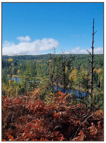
Lake Lången seen from the eastern heights.