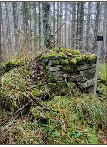
Remains of Karlbergslyckan.